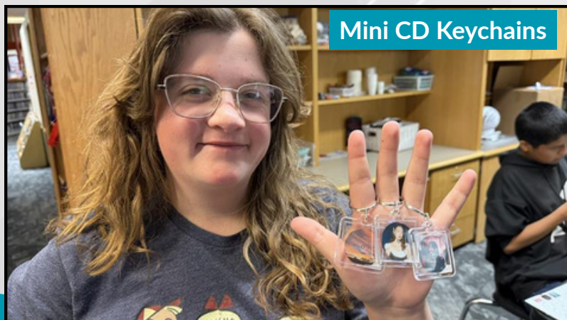
Mini CD Keychains