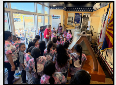
Road to 250

Through immersive and interactive exhibits, visitors explored the "past, present, and future" of both Arizona and the United States in celebration of the nation's 250th anniversary. The exhibit successfully connected local communities with the founding ideals of America while making history engaging, educational, and accessible for all ages.