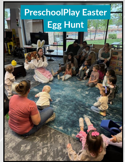
Preschool Play Easter Egg Hunt