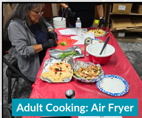
Adult Cooking: Air Fryer