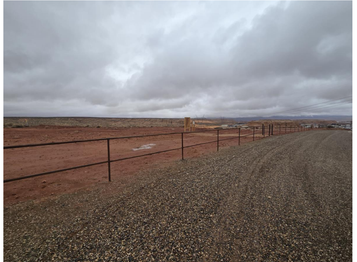
Red Mesa Trail head and Lechee Entrance to Red Mesa Trail.